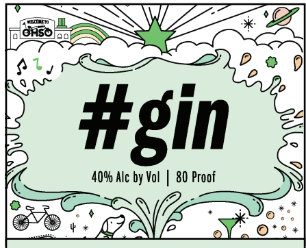
Our #gin starts with a citrus burst, blended with rich botanical notes, and a subtle juniper finish. Recieved 3 medals, including the Gold at the New York International Spirits Festival.

BOTTLING DETAILS 750 ml & 1L / 6 per case 40% alcohol / 80 proof